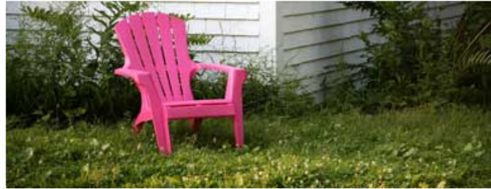
Search Parker Magazine - April 2010